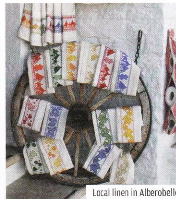
Local linen in Alberobello

I am on a whistle-stop tour of the area, chauffeured around by a black-clad, sunglasses-wearing Italian driver who collects me from Borgo Egnazia, the newest luxury resort in the region.