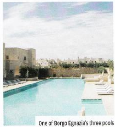
One of Borgo Egnazia's three pools

My trip into the surrounding countryside includes visits to several of these very towns including Polignano, with its maze of streets winding their way down to views of the Adriatic crashing against the cliffs.